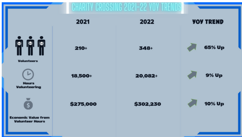
NUMBERS FOR 2022 VS 2021